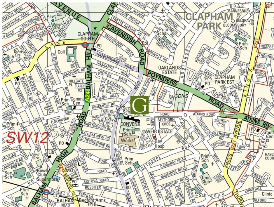
Honeybrook Road, Clapham 🚇 Clapham South (0.4M), 🚇 Balham (0.6M), 🚇 Balham (0.7M)

Clapham has become very popular with young families and professional sharers over recent years. Clapham Old Town and High Street offer a great choice of fashionable bars, restaurants and shops. The close proximity of the Northern Line and Clapham Junction ensures good transport links. Clapham Common is nearby which offers fantastic green spaces as well as an annual music festival. Properties range from modern build and period flats to large Victorian houses.