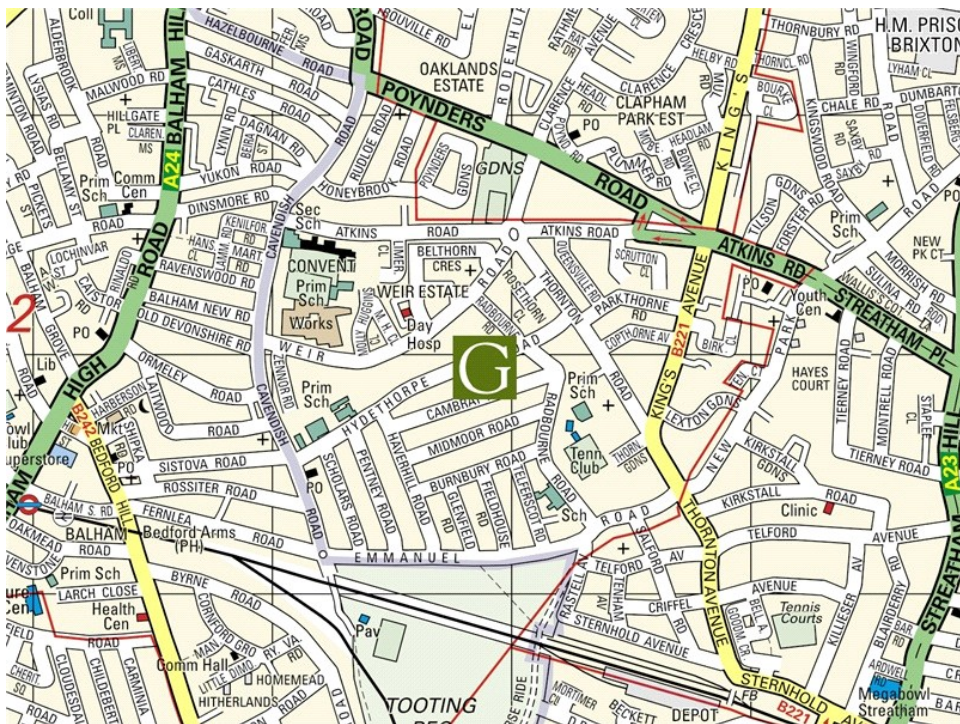
Hydethorpe Road, Balham ➡ Streatham Hill (0.4M), ➡ Balham (0.6M), 🚇 Clapham South (0.6M)

Balham is an area offering great diversity for its residents. From the bustling High Street with its popular bars, restaurants and amenities to the Heaver Conservation area with its beautiful Victorian houses, Balham has plenty to offer either families or professional sharers. Tooting Bec Common is nearby with its famous lido. Typical properties in the area range from newly built apartment blocks and Victorian conversion flats to substantial family houses.